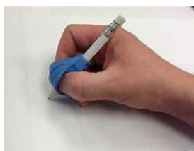
The Grotto Grip