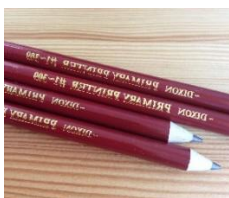
Primary Pencils (Cut them in two or three)